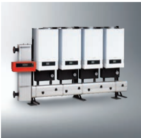
Vitodens 200-W Cascade Systems